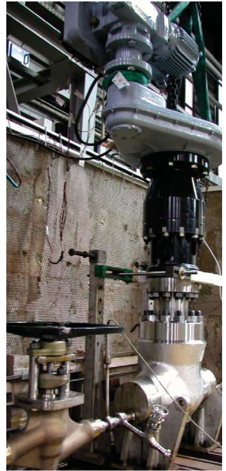
Velan supplied the first contract for nuclear bellows seal valves in 1958. Today's EPR RAMA bellows globe valve is cobalt free and offers state-of-the-art fugitive emissions control and in-line reparability.