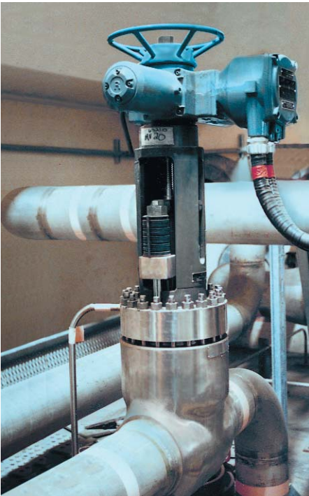
A Velan bolted bonnet gate valve in a PHT transfer system in a CANDU nuclear reactor.

Among the most interesting advances currently underway are the Generation 3+ nuclear plants. These new plants incorporate evolutionary improvements in fuel technology, passive safety systems